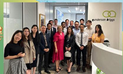
and the QB Team - 2023